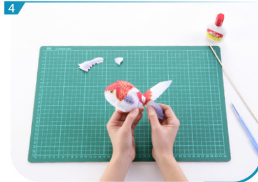
4 Glue G01 and G02, and then glue G04 to the above parts.