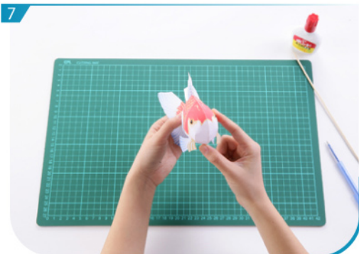
7 Assemble the left and right parts of the body, and you now have a vivid gold fish.