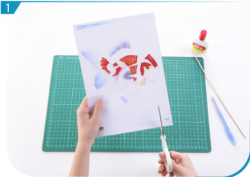
1 Separate all parts along the lines. Mark their identity on the back to avoid confusion.