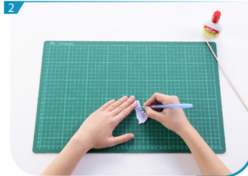
2 Use a pen whose ink has dried out, or a tracer, to trace lines first.