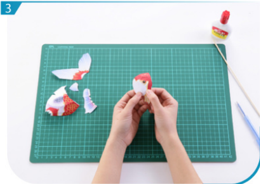
3 Fold and glue G01 and G02 respectively.