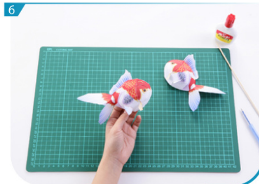
6 The instructions for the right part of the body (H01, H02, H03, H04 and H05) are the same as above.