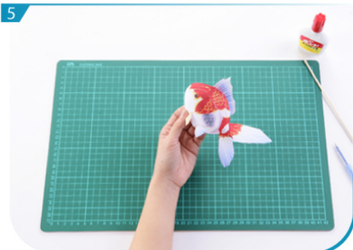
5 Glue G03, G05 and the above parts together to form left part of body.