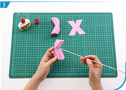
3 Fold and glue X01 and X02 respectively.