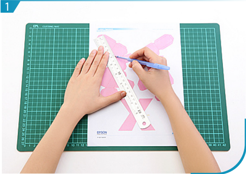
1 Use a pen whose ink has dried out, or a tracer, to trace lines first.