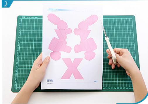
2 Separate all parts along the lines. Mark their identity on the back to avoid confusion.