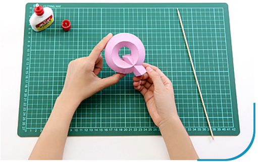
Glue Q01 to Q06 according to the assembly instruction, Letter "Q" is now done.