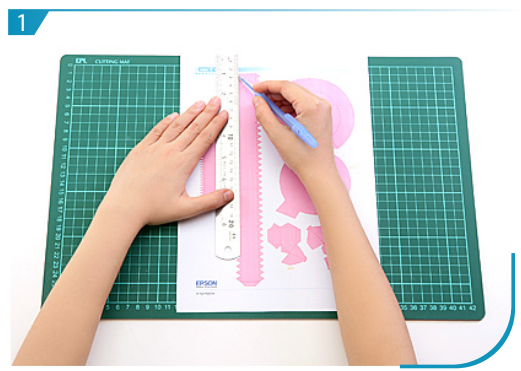
Use a pen whose ink has dried out, or a tracer, to trace lines first.