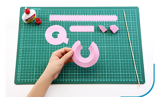
Fold and glue Q01, Q04 and Q05 respectively.