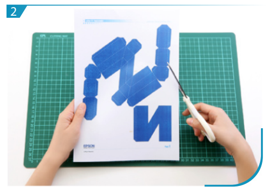
Separate all parts along the lines. Mark their identity on the back to avoid confusion.