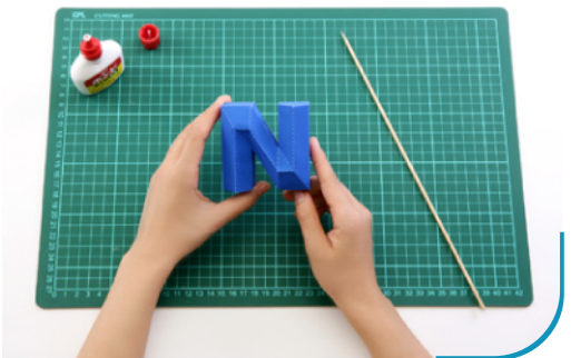
Glue N01 and N02 according to the assembly instruction, Letter "N" is now done.