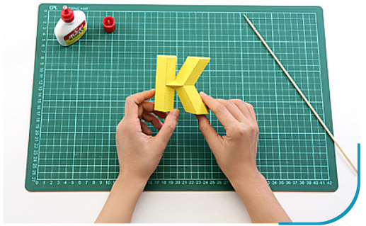
Glue K01, K02, K03 and K04 according to the assembly instruction, Letter "K" is now done.