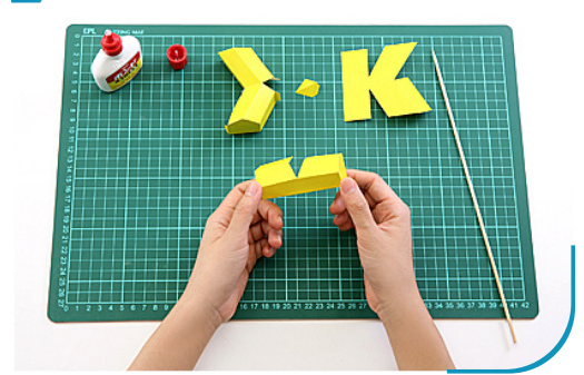
Fold and glue K01 and K03 respectively.