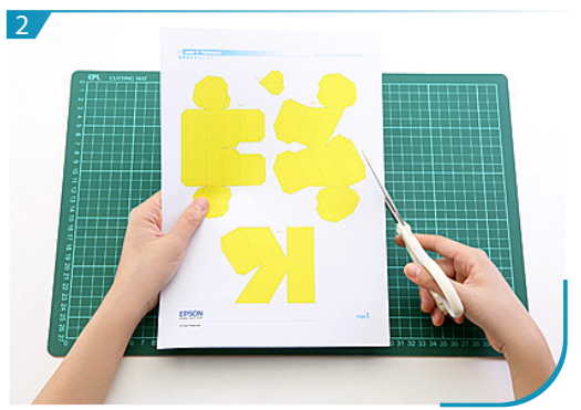
Separate all parts along the lines. Mark their identity on the back to avoid confusion.