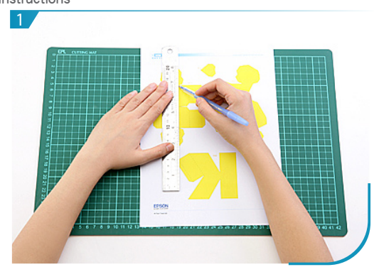
Use a pen whose ink has dried out, or a tracer, to trace lines first.