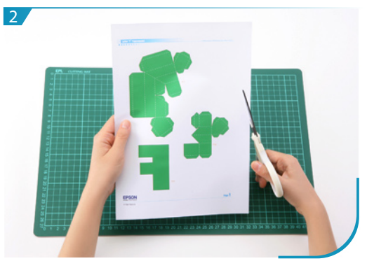
Separate all parts along the lines. Mark their identity on the back to avoid confusion.