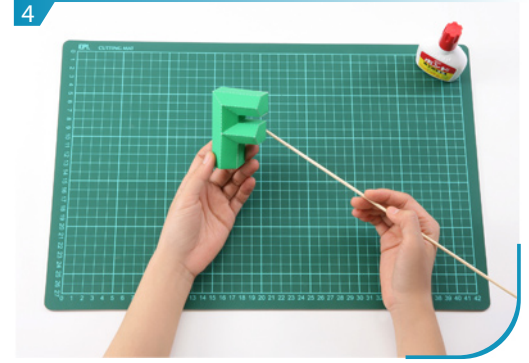
Glue F01, F02 and F03 according to the assembly instruction, Letter "F" is now done.