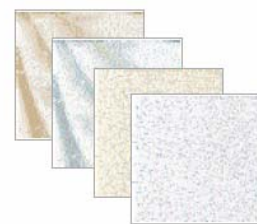
Lace 5, Pearls