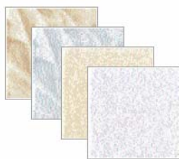
Lace 1, 2