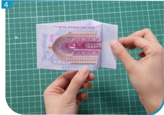
4 Finally, glue the tab so you can send your friends this beautiful 3D card!