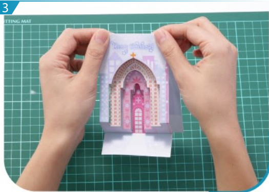
3 Make cuts along all the black lines. Fold the card along the lines.