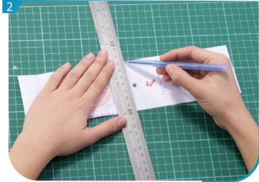
2 Use a pen whose ink has dried out, or a tracer, to trace the lines.