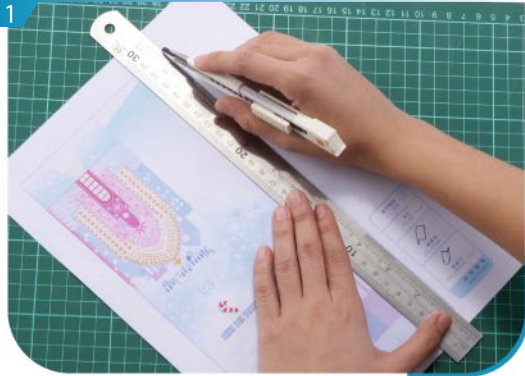
1 Cut the card along the line.